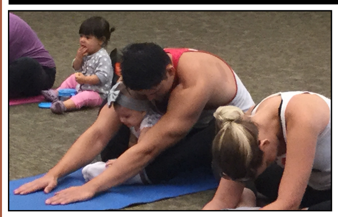
It's all about the kids at the Fallbrook Library