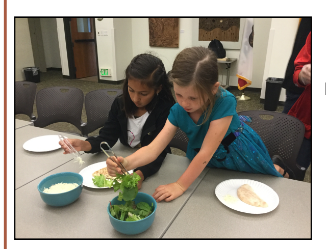
Mommy and Baby Yoga Kindergarten Gear Up Toddlers and Tunes Food and Fun for Kids Spanish 1st and 2nd Grade Book Club