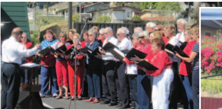
The Fallbrook Chorale