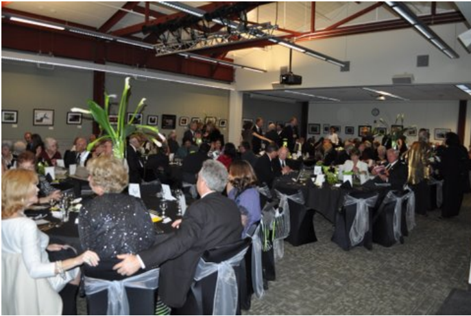
The Community Room