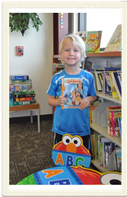
First customer in The Bottom Shelf. He would be seventeen or eighteen years old today.

The Bottom Shelf, after decades residing in the basement of the old building, opened its new doors to an eager crowd and has rarely been without a customer since. From comic books to antiques, donations flow in from Fallbrook's residents keeping the shelves stocked and the business brisk. Year after year, dime after dime, the Bottom Shelf breaks its own sales records. FOFL contributed almost $3,000,000 toward the construction of the new library, much of the funds generated from Bottom Shelf sales.