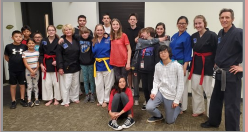
Teen Self Defense