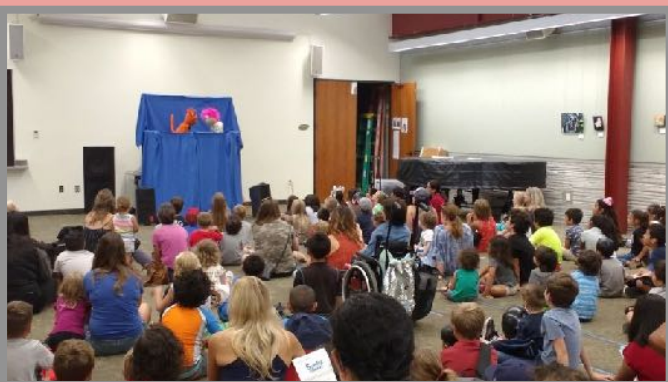
Summer Reading Finale