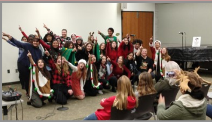
High School Choir Concert