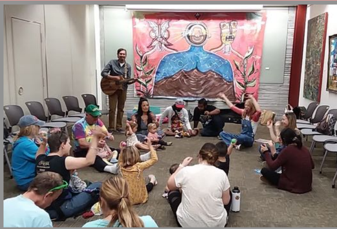
Toddler's & Tunes