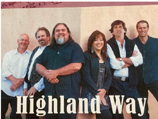
The popular group, Highland Way, playing Celtic music from Scotland and Ireland, was recently featured.