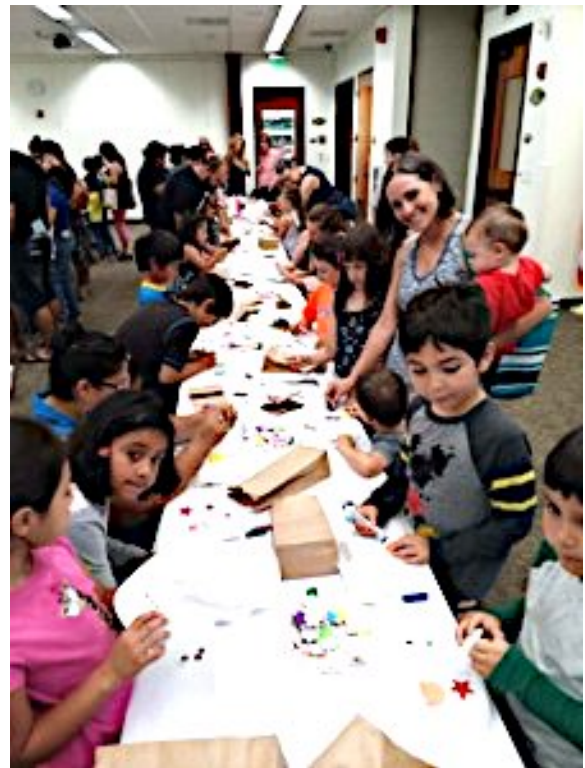
Summer Reading Craft, July 2019

The Community Read for 2019 was The Cold Dish , the first of the Walt Longmire series by Craig Johnson. A packed house enjoyed the author and the event raised record-breaking funds for FOFL.